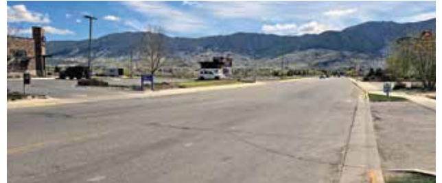
Elizabeth Warren Avenue