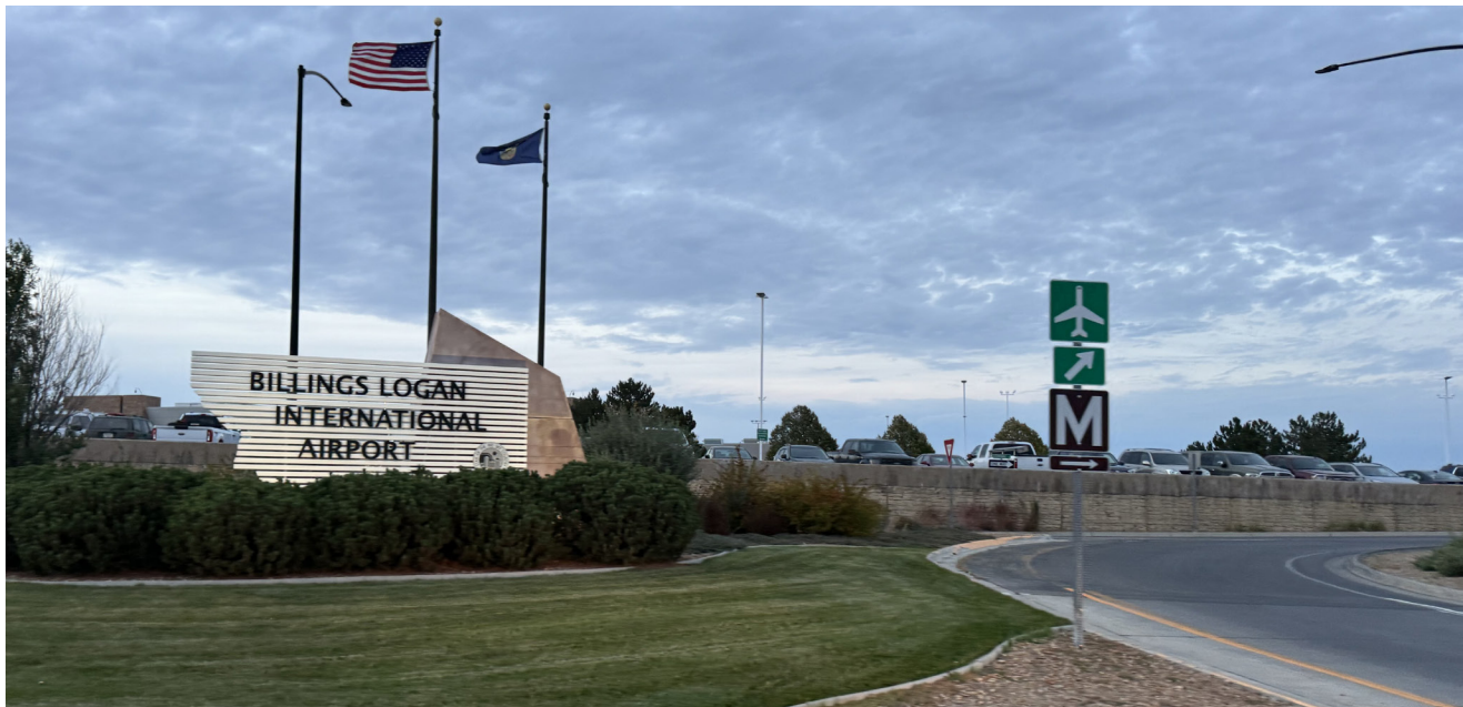
Airport traffic regularly passes through the corridor.