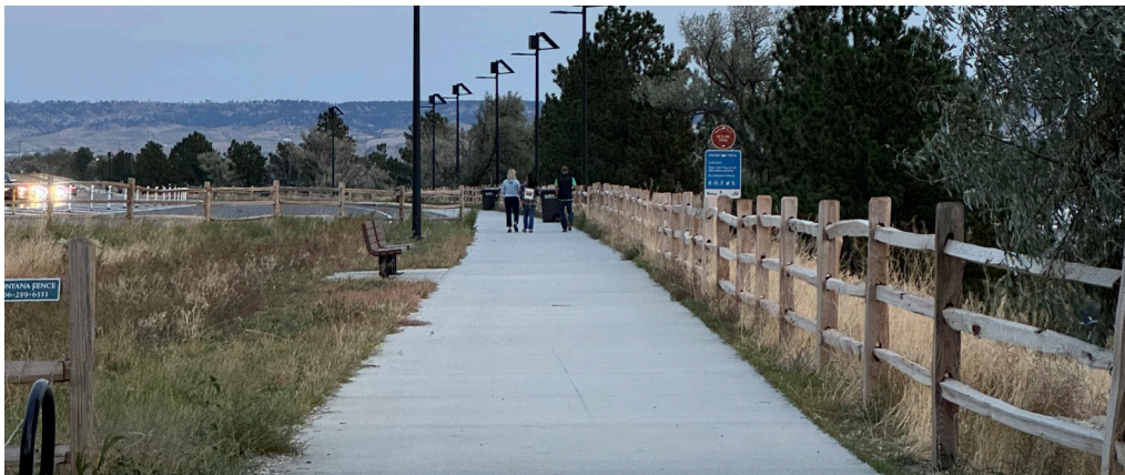
The recently improved Skyline Trail and Zimmerman Park draw many multimodal users to the trail system along the corridor.